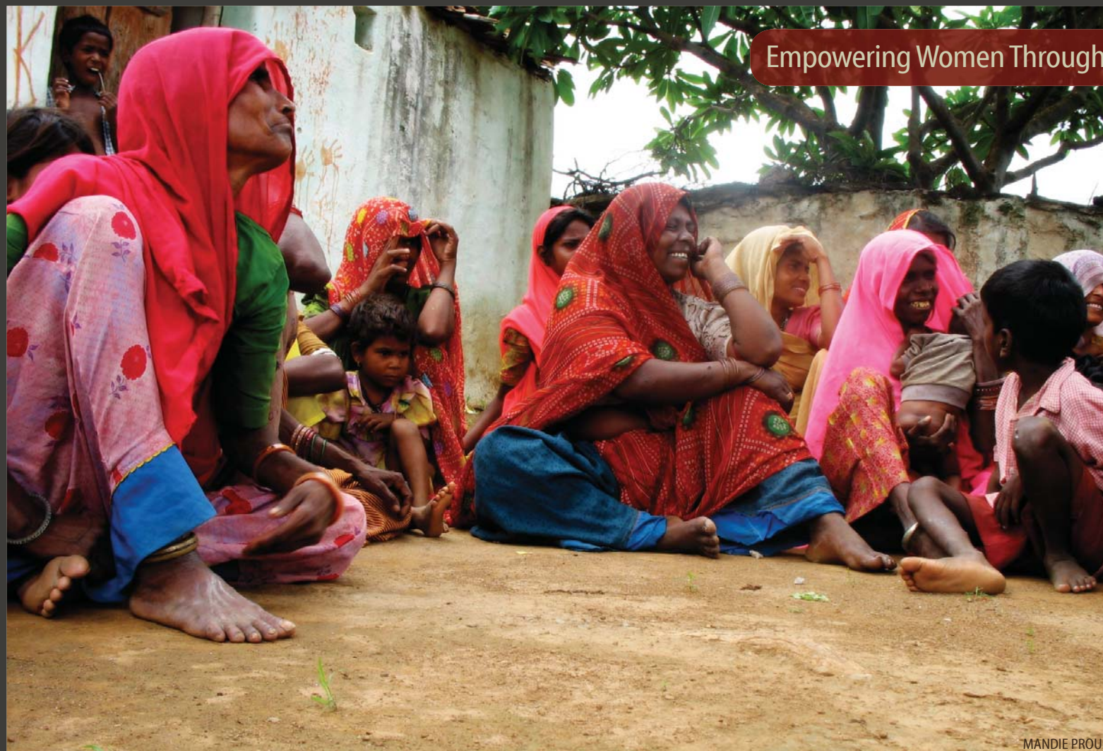
Empowering Women Through Self-Help Groups | Udaipur, India

The FSD Grant Program funds sustainable project initiatives designed by partner organizations and their volunteers. Ranging in size and scope, projects are only funded when communities actively participate in the planning, execution, and maintenance of the work.